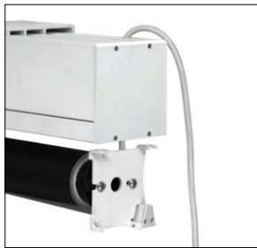
Complete open access to the screen surface