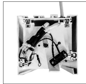
Electrical connection with additional micro-switch