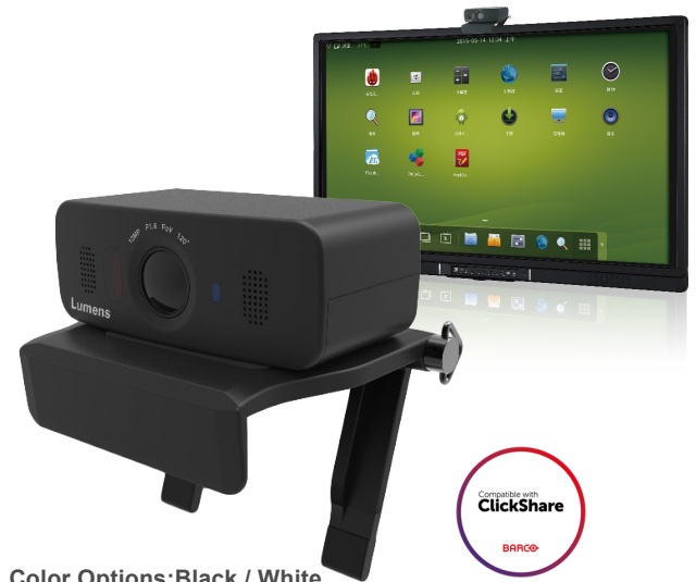
Color Options: Black / White

Compatible with all popular applications and cloud systems: