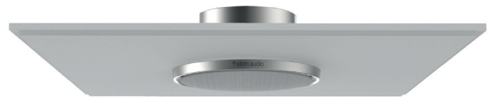
STEM SPEAKER Ceiling Mount