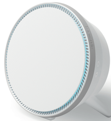
STEM SPEAKER Table Stand