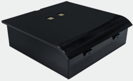
VIS-WBTY2 / VIS-WBTY2-H Rechargeable Battery pack for wireless touchscreen unit