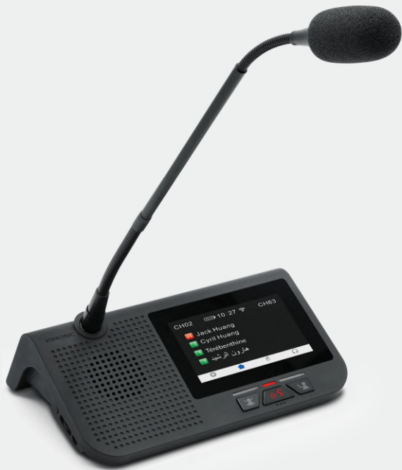
VIS-MAW-T 5G Wireless Multimedia Conference Unit