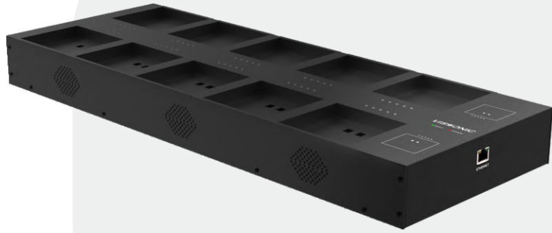
VIS-WCH2 Charger for battery