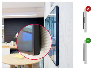
Zero-Gap Wall Mount

Designed to perform in continual, around the clock environments, the LH6570UHB can be installed and utilised in landscape and portrait orientation. The jaw dropping and best-in-class 35mm total depth (when used with the included proprietary brackets) will mean this display can be installed discretely and elegantly in all areas.