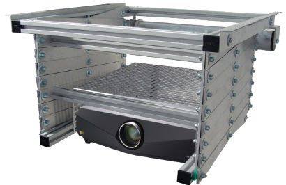
VIDEOLIFT in the closed position