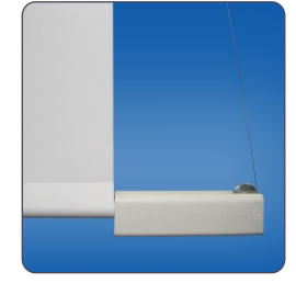
slat bar retracts into the case