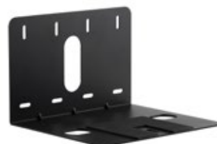
VC-AC03 Wall Mount