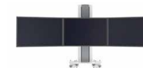
SMS Multi Control Triple Clamp