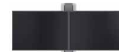
SMS Multi Control Dual Clamp

Big visions fit onto small surfaces! For people who are looking for a solution that does not interfere with the working area. Screens and brackets seem to hover above the desk.