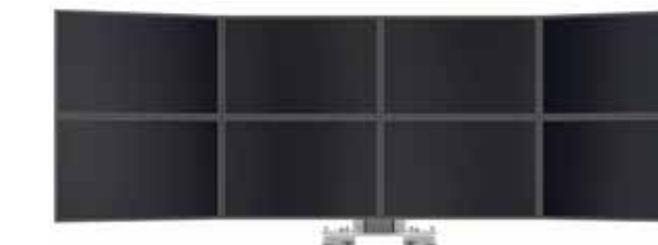
SMS Multi Control 2 x Quad Clamp

Pick your dreamteam. Choose the combination that suits you – we have solutions with from two to eight screens. All can be supplied with boomerang foot or clamp. More information about all combinations, screen sizes and fixtures is available at www.smartmediasolutions.se/multicontrol