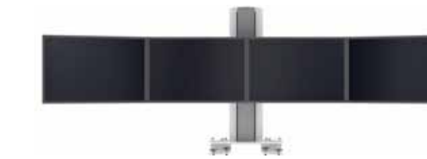
SMS Multi Control Quad Clamp