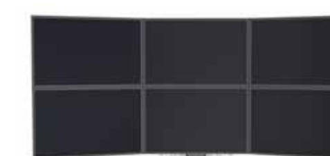
SMS Multi Control 2 x Triple Clamp