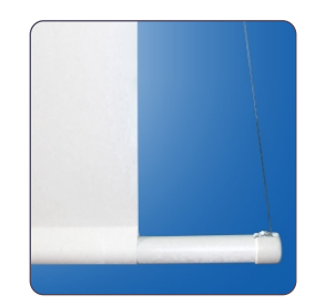
slat bar retracts into the case