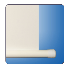
slat bar retracts into the case