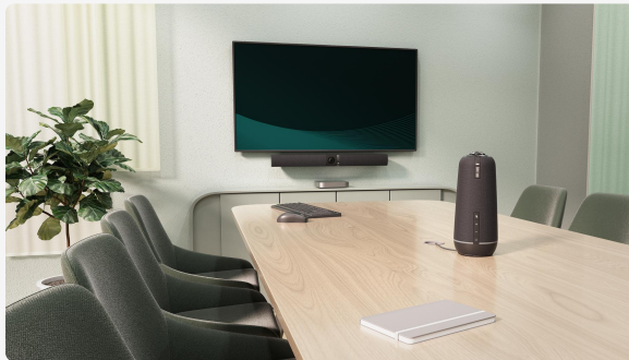
MEETING OWL 4+ and OWL BAR

The Meeting Owl can stand on its own to support smaller huddle spaces or be paired with the Owl Bar or a second Meeting Owl for collaboration in larger spaces.