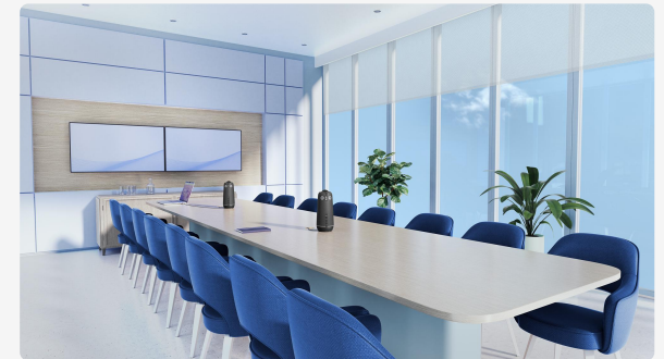
MEETING OWL 4+ and MEETING OWL 4+